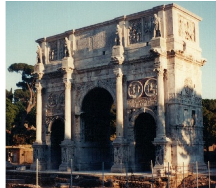
Titus Jerusalem Victory Arch, Rome

Mark is doing this in Mark 13 where he portrays Jesus addressing the crisis of Mark's own time when the Roman general Titus had finally crushed the Jewish revolt begun in 66 CE, had captured and sacked Jerusalem and destroyed the temple in 70 CE. Mark's starting point was very likely to have been Jesus' own predictions that the temple would face destruction. Mark elaborates this for his contemporaries and has Jesus go on to use the illustration of new shoots on a fig tree heralding summer, to give a warning: "So also, when you see these things taking place, you know that he is near, at the very gates. 30 Truly I tell you, this generation will not pass away until all these things have taken place" (13:29–30).